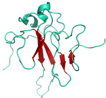
Structural model of the Nucleocapsid protein of SARS-CoV-2 (RNA binding domain only, amino acids 43-180). Beta stands are highlighted (red).

Beneath its envelope membrane, the new coronavirus SARS-CoV-2 consists of a icosahedral nucleocapsid that contains its genetic information in form of positive sensed single-stranded RNA. The RNA is contained in a nucleoprotein complex, consisting of the SARS-CoV-2 (COVID-19) Nucleocapsid protein. This phosphoprotein is necessary to keep the capsid in its helical symmetry and aids with packaging into the viral capsid by acting as a molecular RNA chaperone. Together with the matrix (M) protein, the N-protein is one of the most abundant proteins in the viral particle, it is important for viral replication and is also known for modulating cellular signaling. It is highly immunogenic and its sequence is very conserved, therefore it is an attractive target for diagnostic purposes.